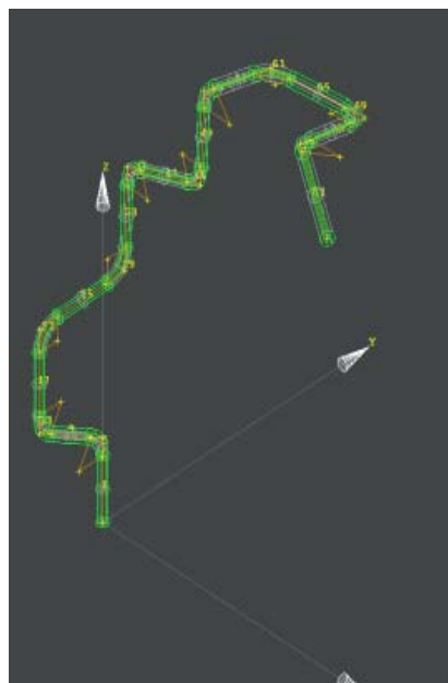
Transformation with iQconvert