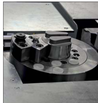
▼ 2-radii bending and coiling tool