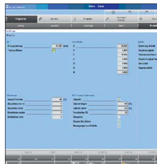
▲ iQbend in WPS 3.2 EasyWay