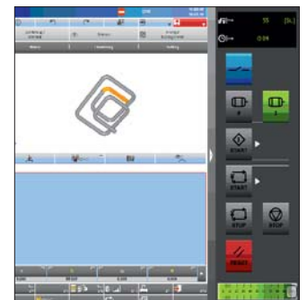
▲ User-friendly WAFIOS programming system WPS 3.2 EasyWay