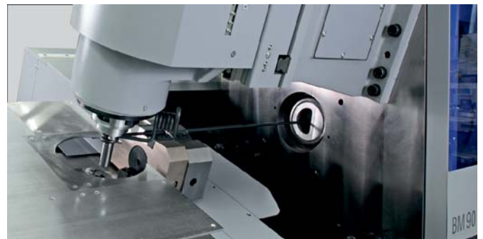
▲ Coiling unit