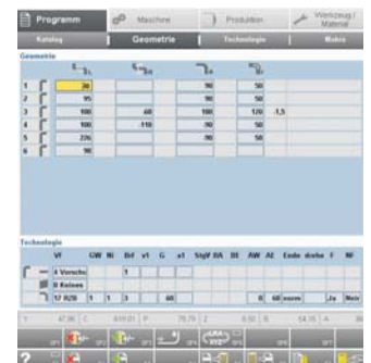
▲ Modern and easy-to-use programming and control software WAFIOS WPS 3.2 EasyWay