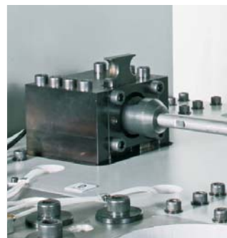
▲ Mandrel bending unit freely programmable over entire tube feed length (patent)

High production output and a long service life will save money and shorten the amortization time of your investment.