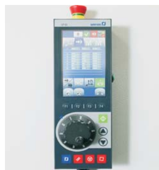
▲ New handheld unit with touch screen

The extremely flexible and universal WAFIOS tool systems increase the service life of the machines significantly. Tools for roll-bending, rotary-bending and free-form bending operations can be employed. As the bending head enables left- and right-bending operations in one clamping, the production of complicated two- and three-dimensional work pieces is possible in one pass. Due to the WAFIOS tool systems, bending times, unproductive times and retooling times have been reduced to a minimum.