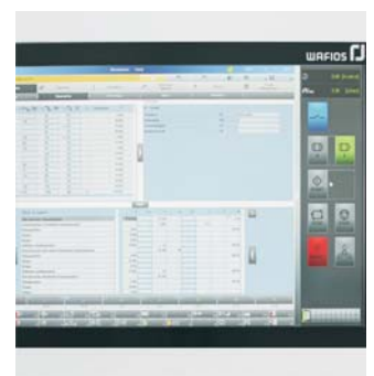
▲ User-friendly control due to WAFIOS programming system WPS 3.2 EasyWay