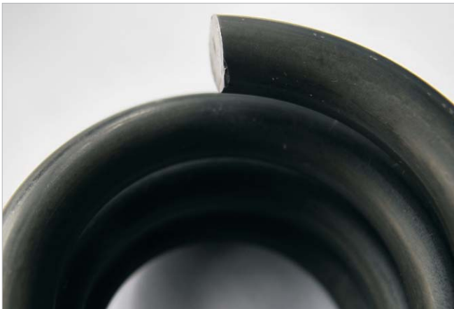
▲ Torsion cut - example of cut

Due to wire diameter independent tools and very low tool wear, the WAFIOS Torsion Cut Tool System is the economic alternative for the production of parts that require absence of burrs and a plane cutting surface.