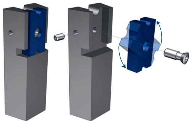
▲ Cutter holder with carbide insert

Cutting various wire qualities with Ø = 3.5 mm, 4.0 mm and 4.5mm and a tensile strength of up to 800 N/mm 2 (approx. 116 ksi).