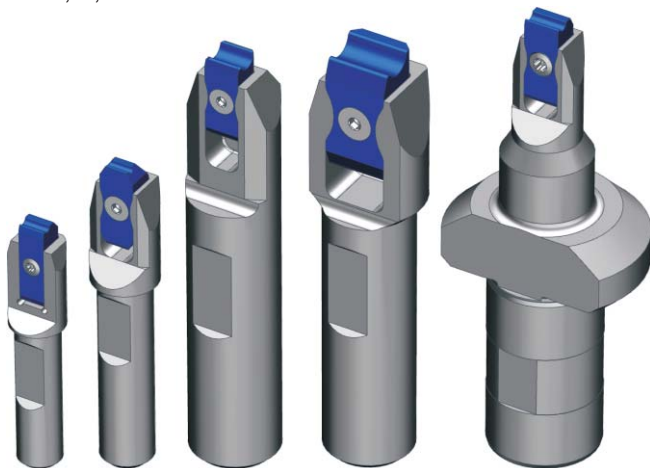
▲ Holder with coiling insert - types