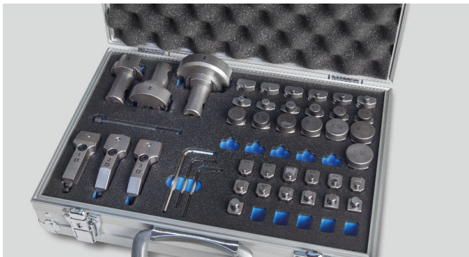
▲ Set of tools with bending mandrel holders and bending pin holders in three different sizes (G1, G2 and G3) as well as the according bending mandrel and bending pin inserts