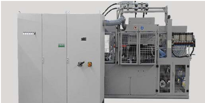
▼ KEH 8 – Back side