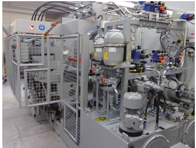
▼ KEH 8 – Hydraulic power unit