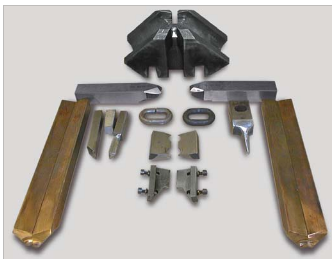
▲ Set of tools for KEH

KEH-series chain welding machines are used for the resistance butt welding of bent round steel chains with notching on the chain link ends. The welding burr on the chain link is completely deburred by the chain welding machine.